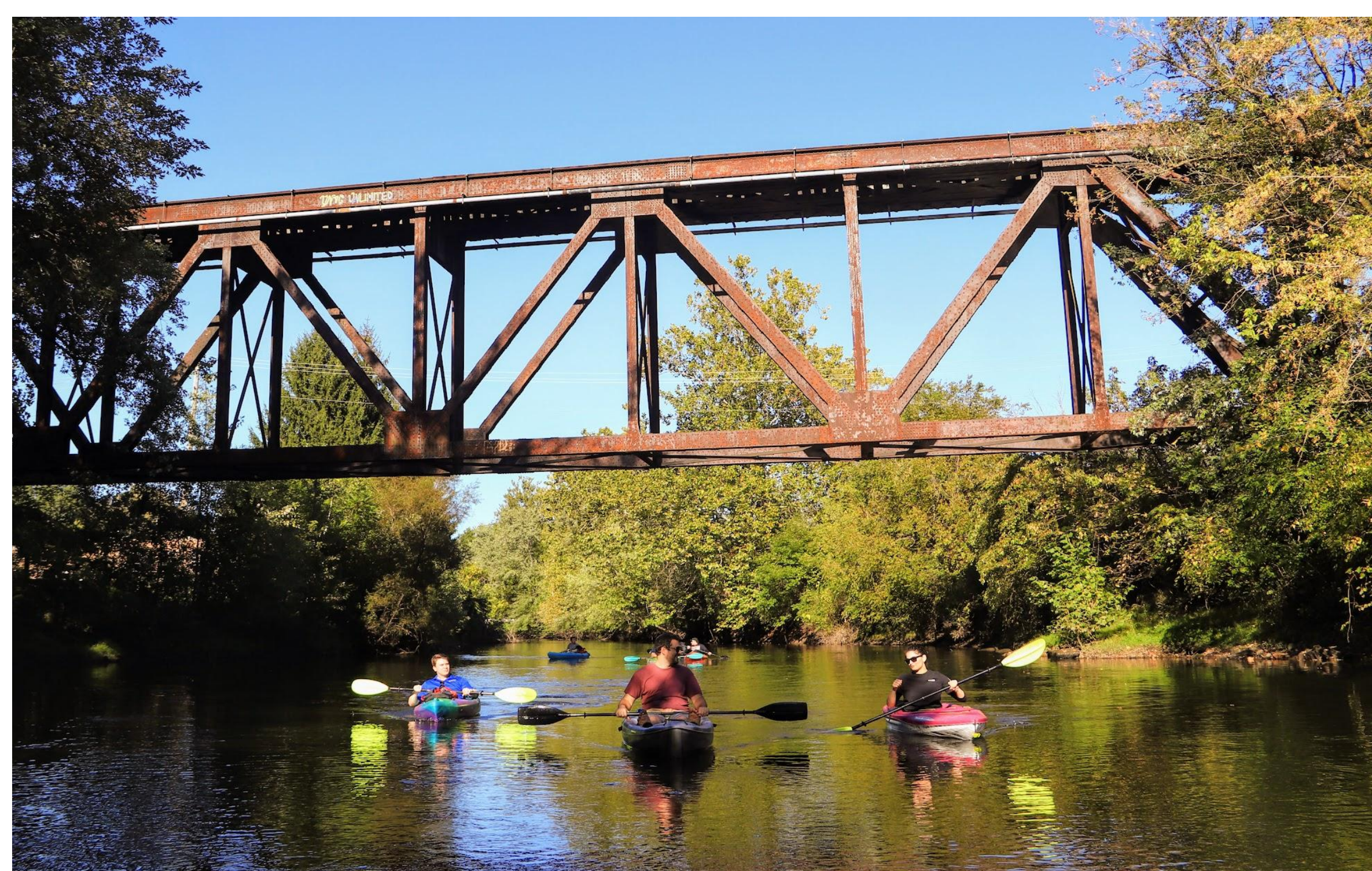
Co-op Kayak Adventure