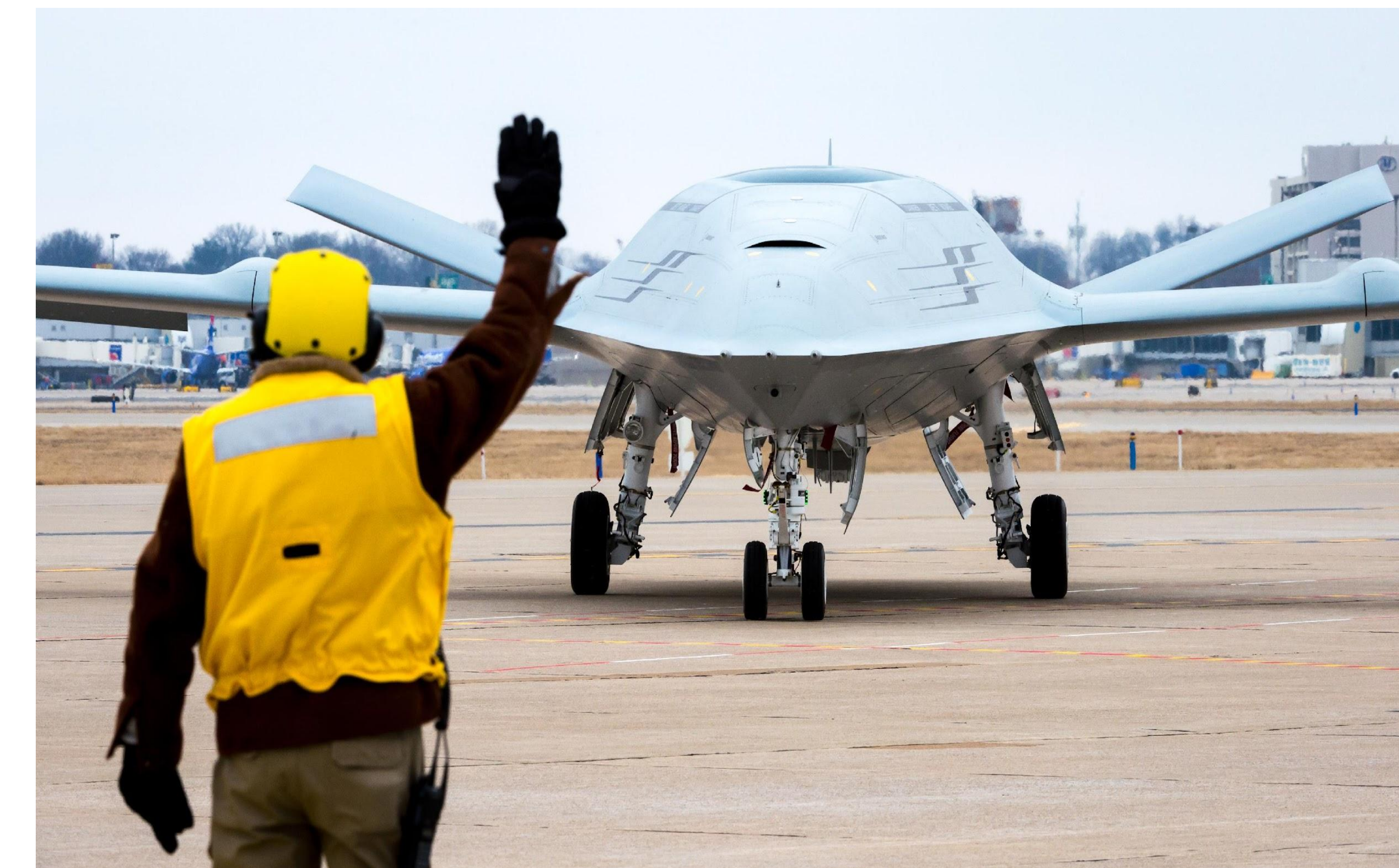
Boeing MQ-25 Stingray

Safran Twinsburg is an incredible workplace filled with some of the smartest and most friendly people I have ever met. The staff includes several engineers with decades of experience who love nothing more than passing off their knowledge to the co-ops lucky enough to work there. The work is fascinating, and there are new things to learn every day, both about the products and about the industry as a whole.