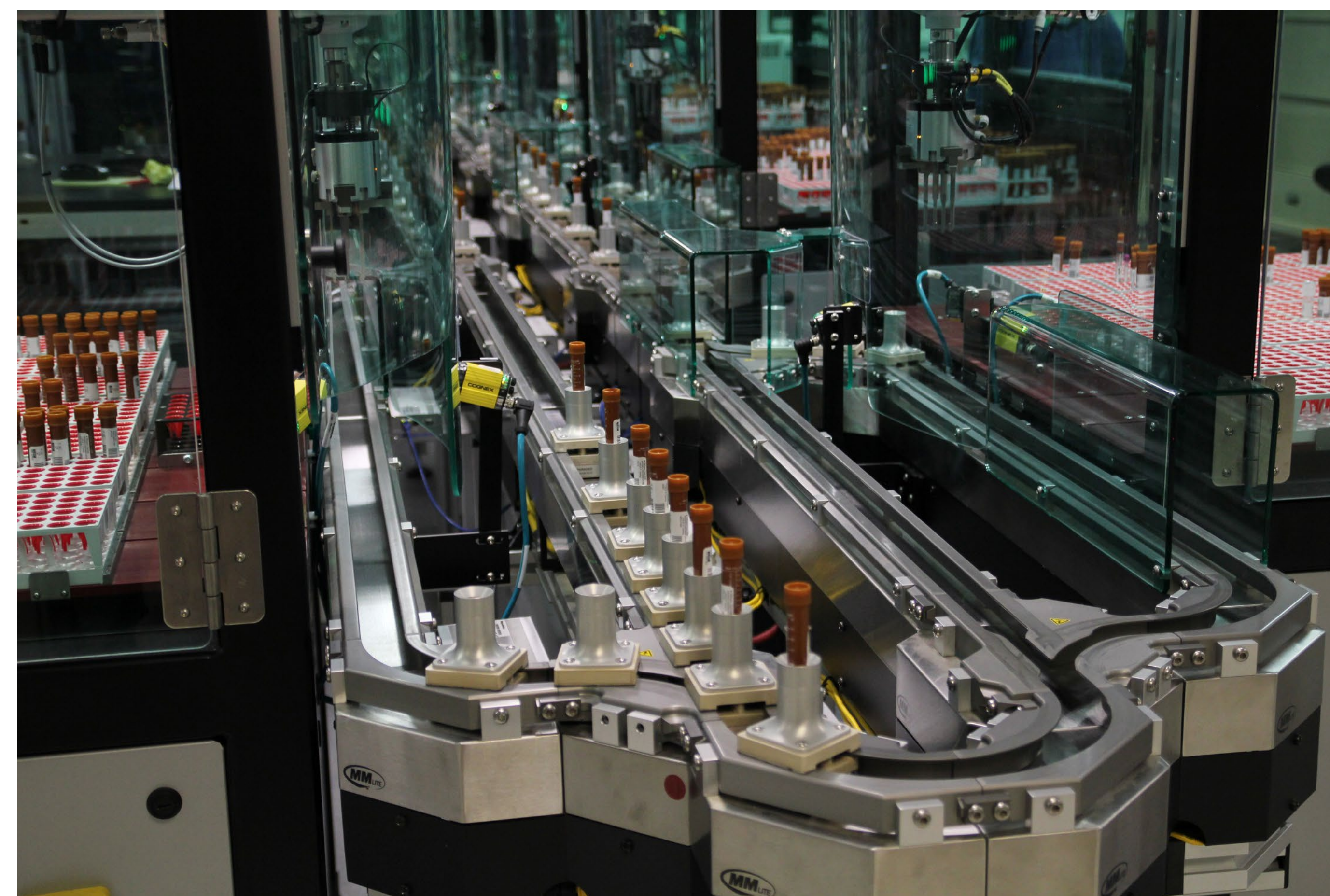
Figure 2. MagneMover Lite in the Field