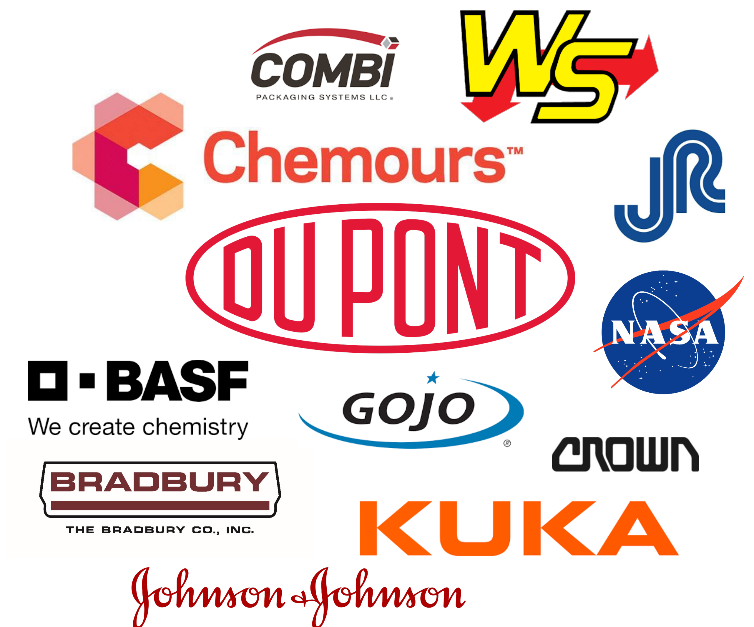
Figure 4. Collage of Customers

I learned many things about the controls industry. By participating in shadow calls and meeting many customers, I was able to learn about customer focus areas and their needs. One of my key takeaways was that customers want a better conveyor system to reduce downtime. Overall, ICT is a flexible intelligent conveyor system that is fully customizable allowing the customer to create any track that will fulfill their needs.