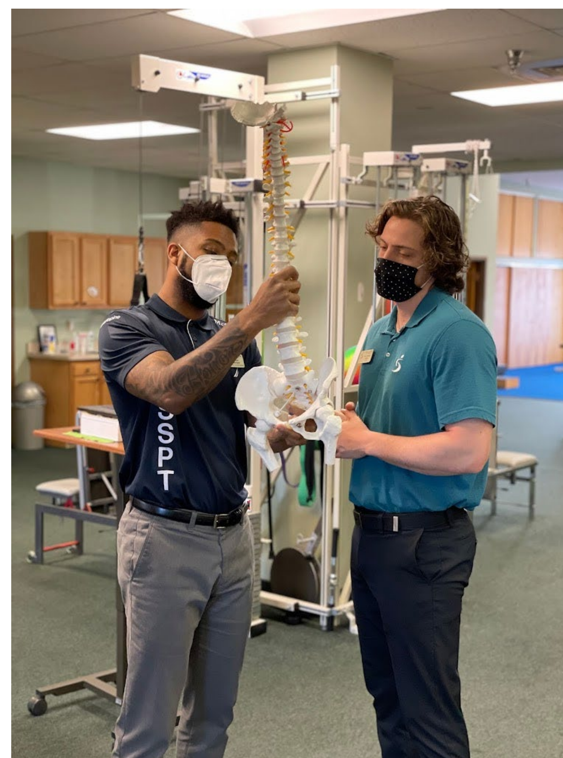
Figure 1. Education of lumbar facet joints