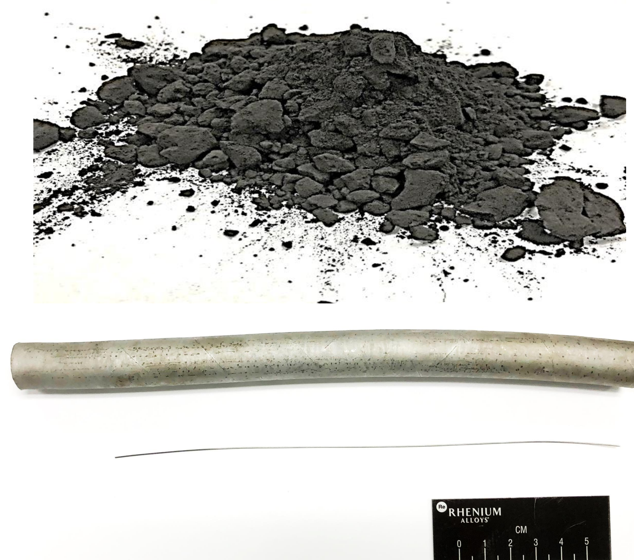
Figure 2: top – rhenium powder; bottom – 16.5mm sintered rod and final 0.5mm drawn wire