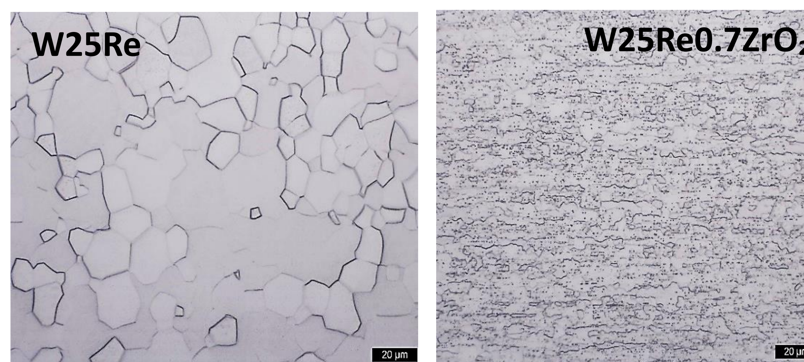
Figures 3 and 4: 500x mag; 0.5mm diameter drawn wire longitudinal microstructure after 60 min exposure at 1650°C