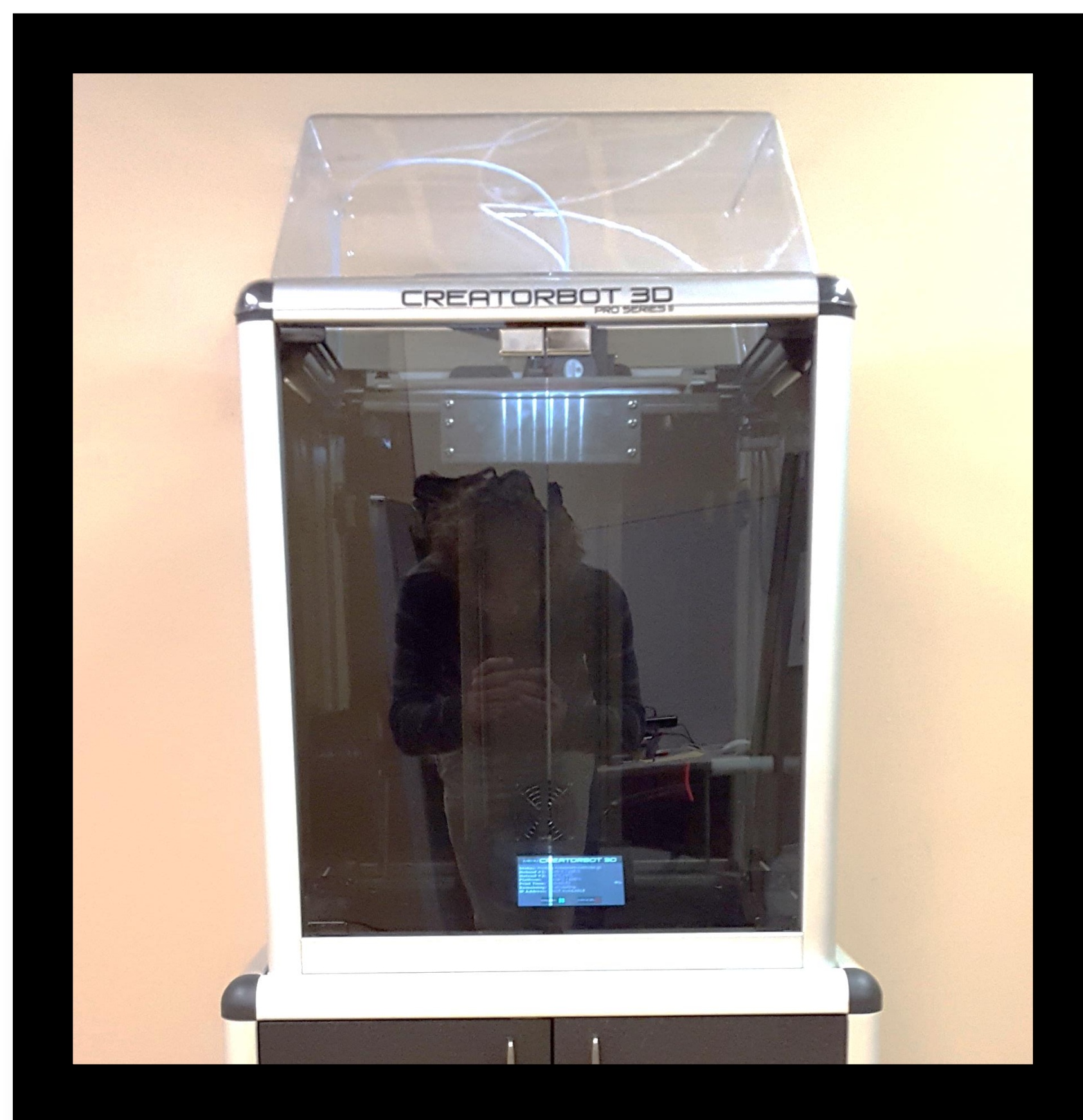
CreatorBot Printing System