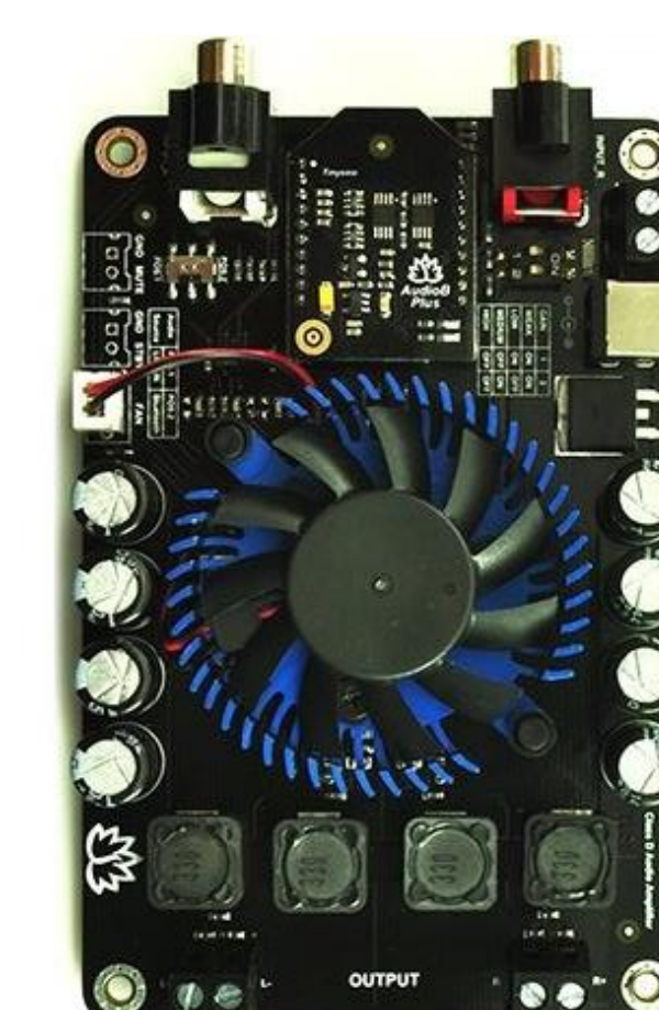
Figures 3 and 4. Shown is our amplifier board to power our speaker along with the attached power supply.