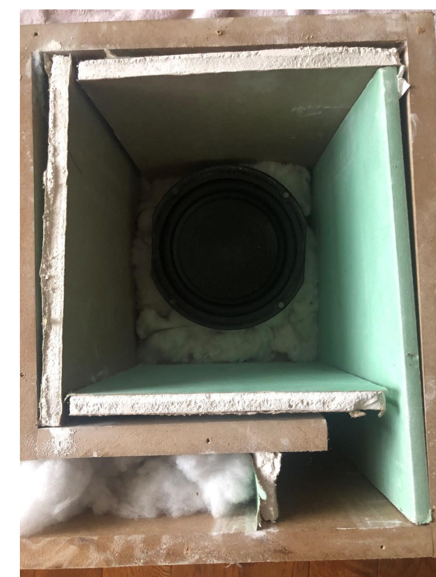
Figure 1. A box made out of \frac{3}{4} " MDF lined with our \frac{1}{2} " thick drywall with the a 5" speaker inside. During testing the box was sealed to keep the sound contained and the thickness at a constant.