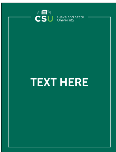
VERSION 1 (IN PORTRAIT VIEW)