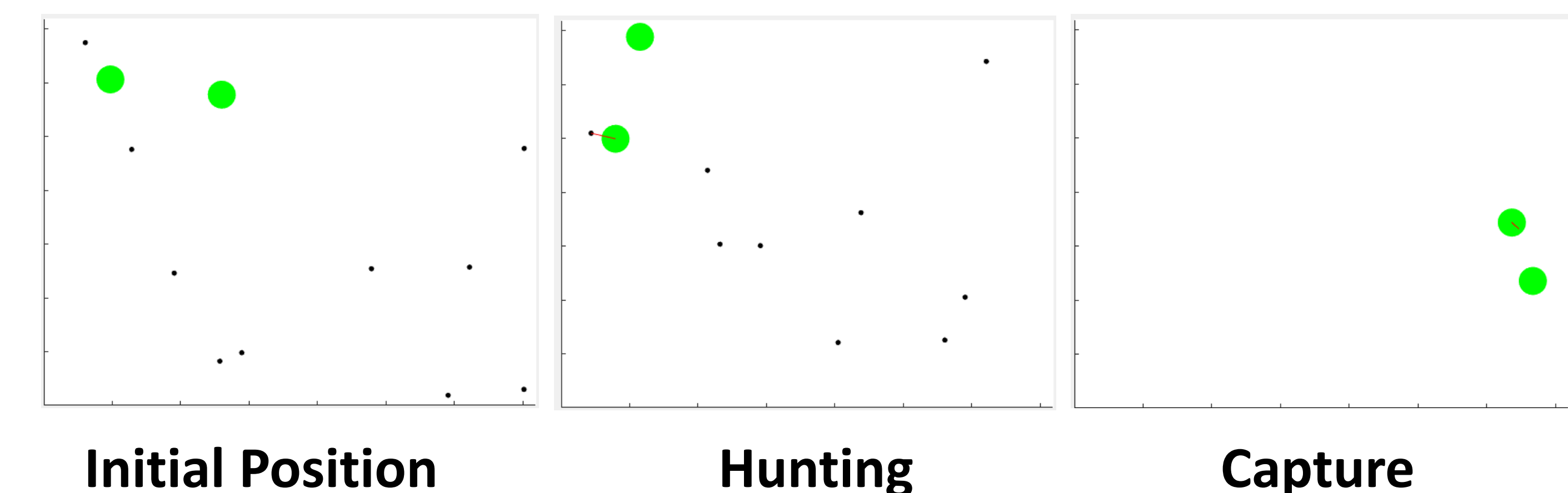
Figure 5. Still frames from a simulation in MATLAB with multiple frogs and roaches

We plan to nondimensionalize our system to simplify the model and remove units. We can also increase the number of frogs or roaches in the system with minor tweaks.