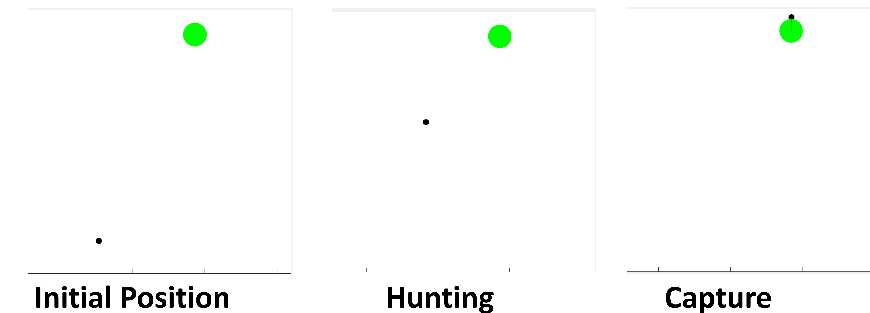
Figure 4. Still frames from a simulation in MATLAB

We wrote a MATLAB script to run simulations using the model we created. Upon running the script, the simulations match the observations recorded during feeding sessions. The frog remained stationary as the roach slowly traveled towards it, until ultimately getting devoured.