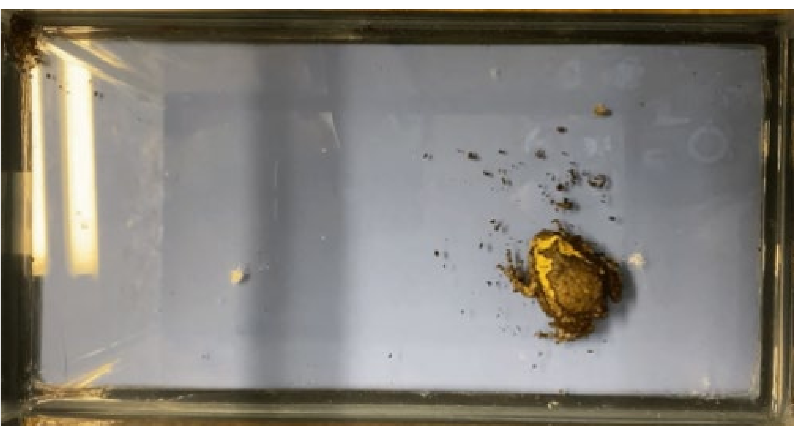
Figure 2. Still frame from feeding recording. Roach is above the frog