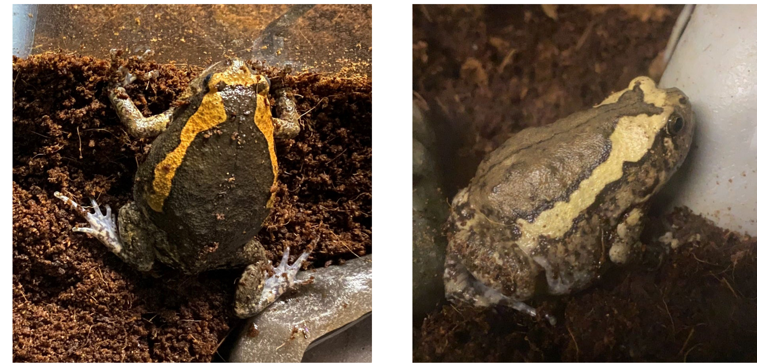
Figure 1. Two male Kaloula pulchra displaying their long toe and distinctive stripes

Each agent in our model needs a self propulsion term to exponentially enforce a constant movement speed. This is the first term in our system on the right. In the roach acceleration equation, we can simply use a white noise function with diffusion D to represent their erratic movements.