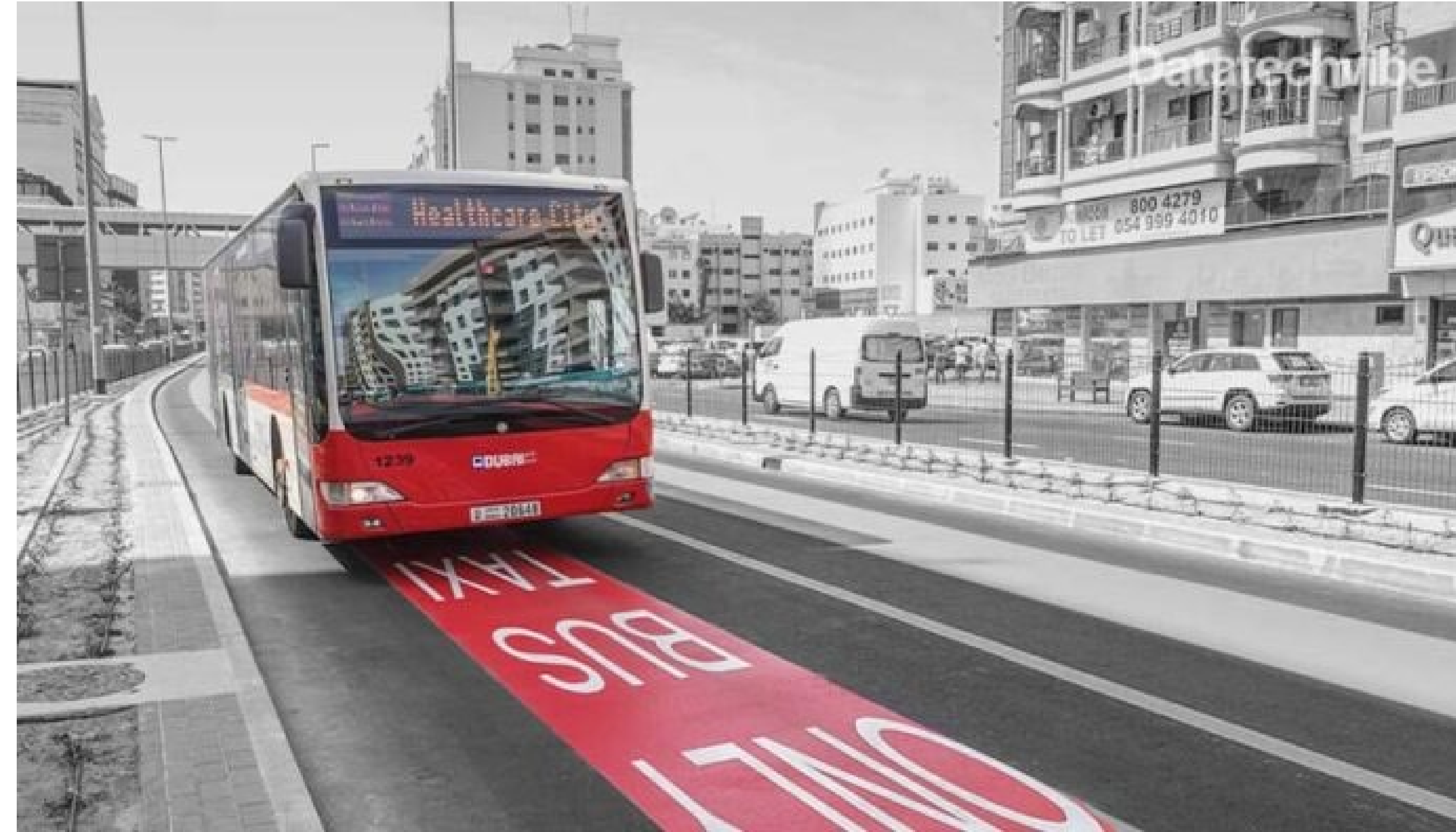
Figure 3. Buses in Dubai are using AI to reduce costs and travel times